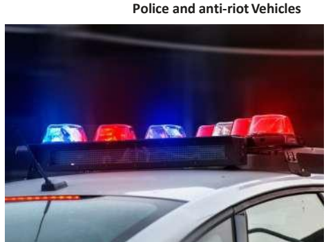
Impact-resistant glass. Integration with OEM components to ease the installation.