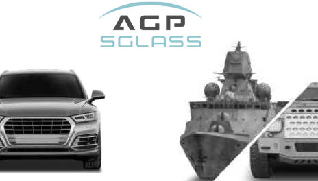
BUILTET-RESISTANT GLASS FOR CIVILIAN APPLICATIONS

AGP sGlass, is the division of AGP that designs and manufactures safety and security glazing solutions for civilian, military and naval applications. AGP eGlass focuses on finding and responding to modern trends in electrification, connectivity, shared mobility, autonomous driving and performance. eGlass offers smarter, lighter and tougher solutions tailored for vehicles of the future.